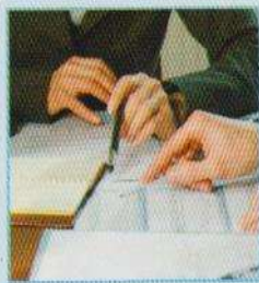
Capacity Building Courses