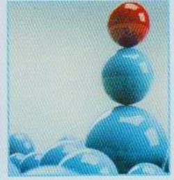
Shariah Advisory Services