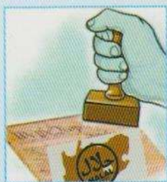
Halal Auditing & Certifications