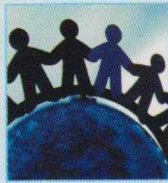
Liaison "International Halal Agencies"